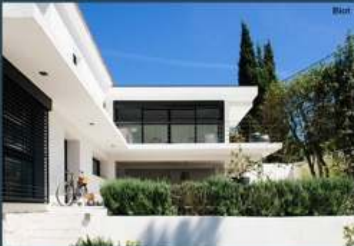
Extension - Pool House - Interior Design

Contact details: Claudine MEYER +33 6 03 02 23 14 🇫🇷 extension-contemporaine.fr