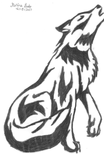
A superb drawing by Marina Bodo Ghaly—Form 5b