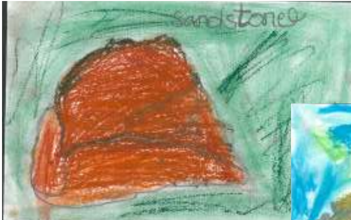
Ishaan Prateesh—Form 3b