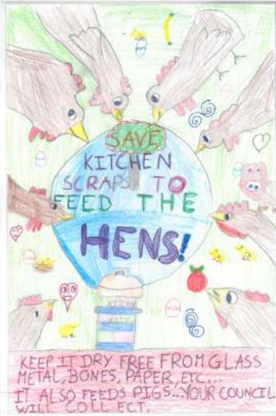
Neve Mayall—Form 5b